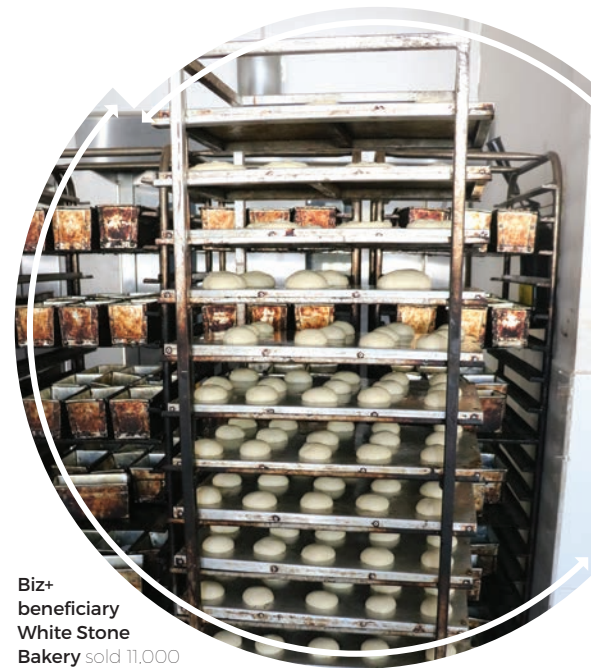
Biz+ beneficiary White Stone Bakery sold 11,000 muffins, 2,000 donuts, 1,000 curry buns and 200 peanut cookies to the throngs who assembled at the Shrine during Pope Francis’ visit in 2015.

Their work has helped create a collaborative atmosphere between USAID, other donors active in the region and local government. District governments have enthusiastically approached the process, and they have become empowered to lead development initiatives.